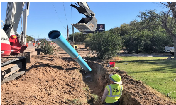
File Construction Installing 12 inch Water Line.

The project was awarded to File Construction in the amount of $520,240.60. The project is funded by the Colonias Infrastructure